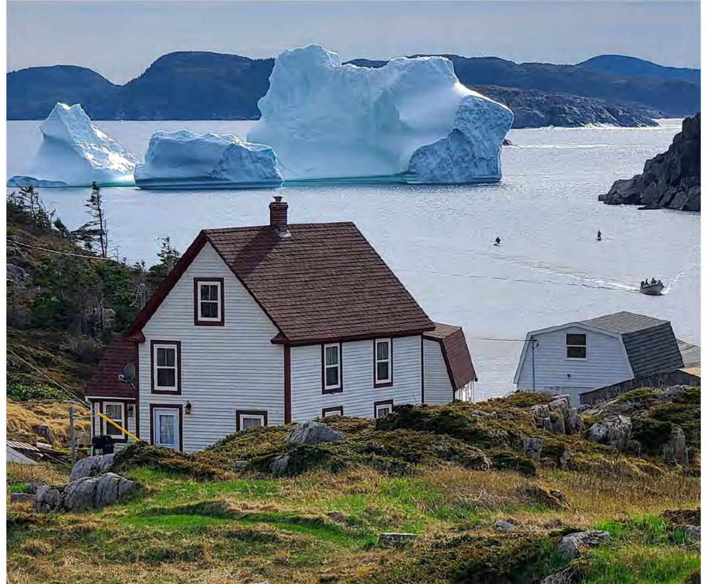
Merritt Harbour, Newfoundland May 23, 2022